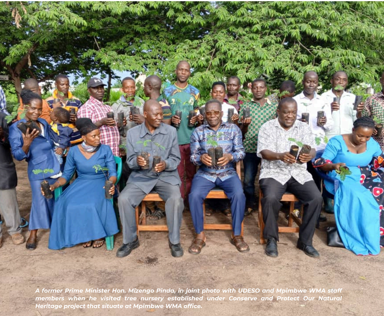
A former Prime Minister Hon. Mizengo Pinda, in joint photo with UDES0 and Mpimbwe WMA staff members when he visited tree nursery established under Conserve and Protect Our Natural Heritage project that situate at Mpimbwe WMA office.

The project established one honey processing center in Kibaoni Village. The center has 2 rooms, one designated for honey processing and the other as a retail shop. The processing room will be equipped with equipment to ensure high-quality bee products.